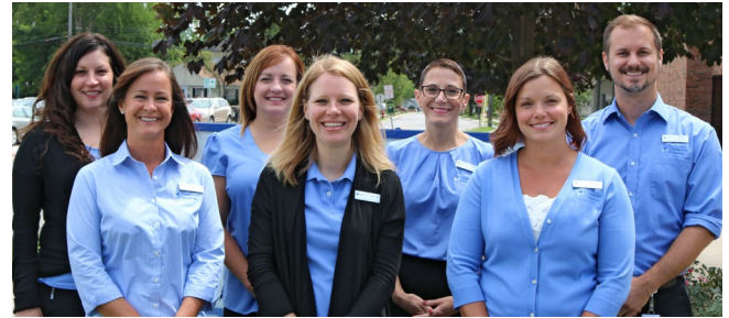
Student Credit Union Team

We wish all of the students their best and we look forward to working with them during the 2017-2018 school year. Learn more about opening a savings account for your child by visiting www.cfcu.org/scu .